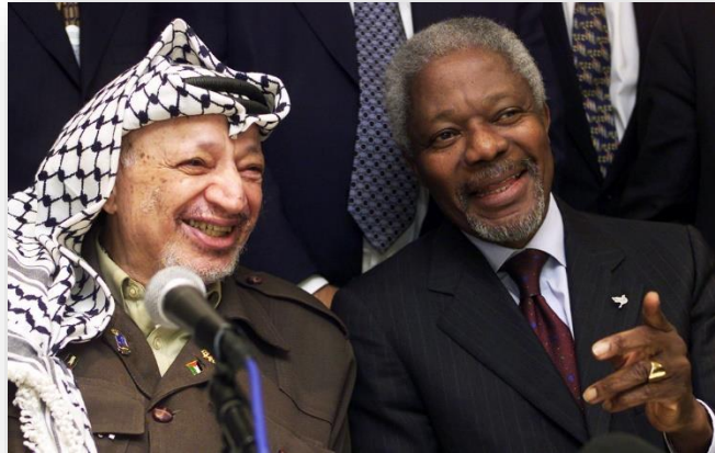
Yasser Arafat, Kofi Annan