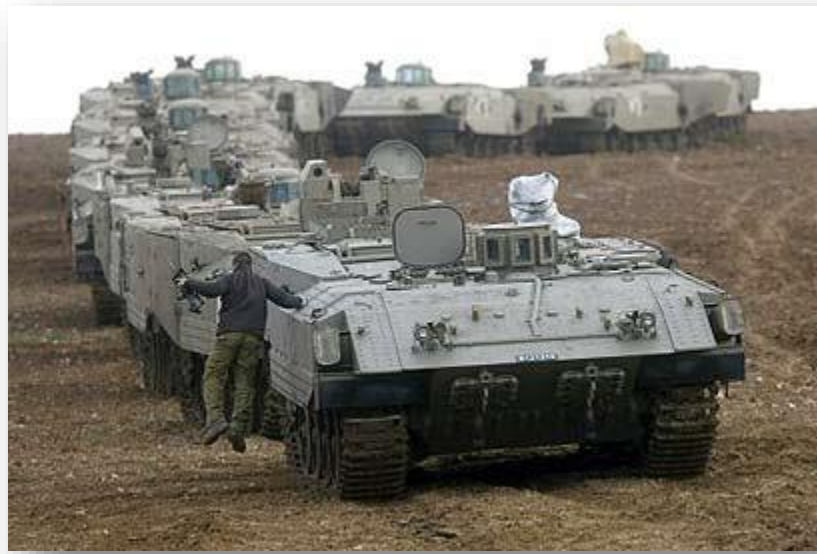
Operation Cast Lead (2008)