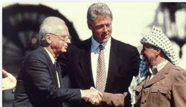
The Oslo Accords 25 years on

The Oslo Peace Accords signed in the early 1990s aimed to end the bloodshed. The first Oslo Accords (Oslo I) established a Middle East peace process timeframe. They laid out plans for an interim Palestinian administration in Gaza and sections of the West Bank. The agreement was signed in 1993 with the participation of Israeli Prime Minister Yitzhak Rabin and Palestinian President Yasser Arafat. After 27 years in exile, Arafat reappeared in Gaza in 1994. He was the new Palestinian Authority's president. Oslo II signed in 1995, established the framework for Israel's complete departure from areas of the West and everywhere else (Shlaim, 2016). It also shows a schedule for the Palestinian Legislative Council elections.